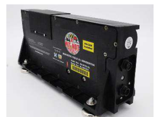
XL Generator is available for larger equipment.