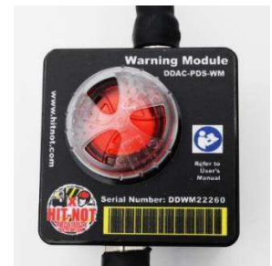
Warning Module provides audible and visual alert for operator