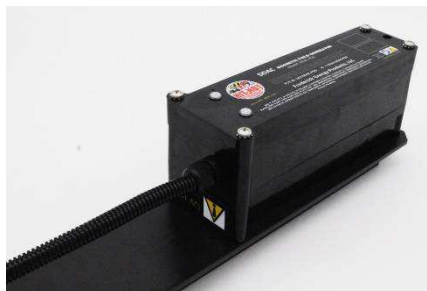
Generator Shown on Standard Mounting Bar, other mounting options available

HIT-NOT® Magnetic Field Generator Systems include the Generator, Warning Module with REM, and Cab Silencer. It creates a precise, adjustable, magnetic field boundary around the mobile equipment.