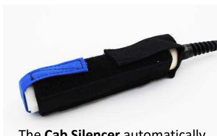
The Cab Silencer automatically disables the operators PAD while on the mobile equipment.